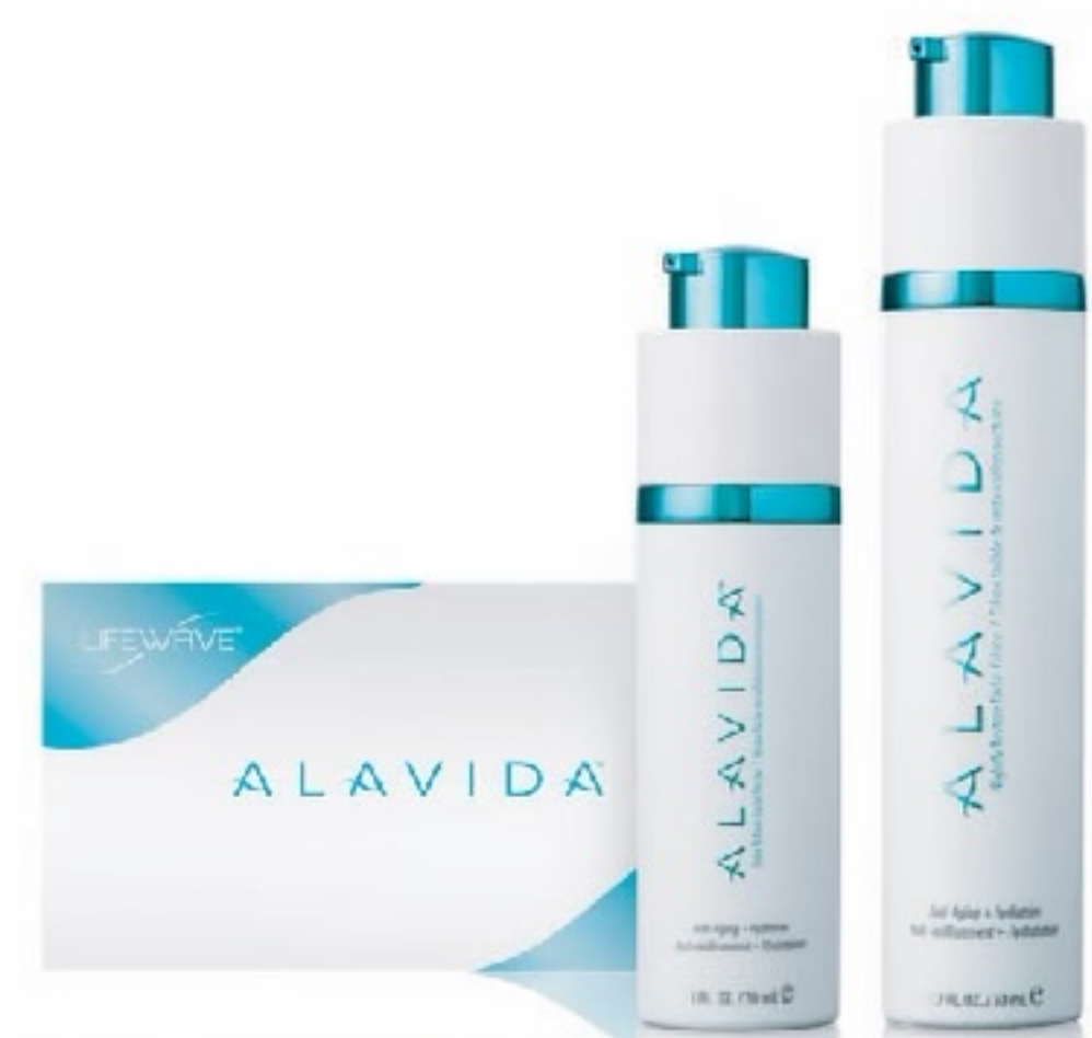
ALAVIDA Regenerating Trio

Carnosine protects neurological system, improves bioelectrical properties of organs and promotes overall health and wellness of the brain, heart and muscles. Improves cognitive functions, prevents mental decline and visual degeneration. Enhances athletic performance by enhancing strength, flexibility and stamina.