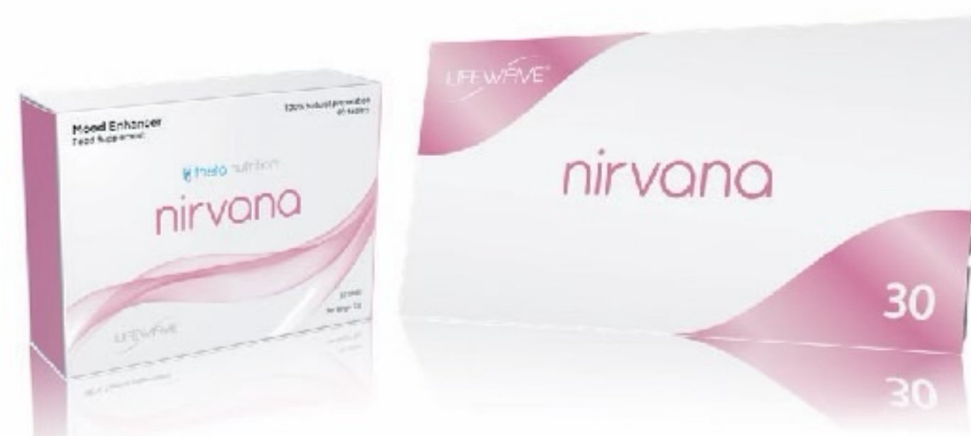
Nirvana Mood Enhancer System

Elevates healthy production of beta-endorphin to enhance mood without drugs, chemicals, or stimulants. It contributes a positive impact towards a well balanced emotional and mental health.