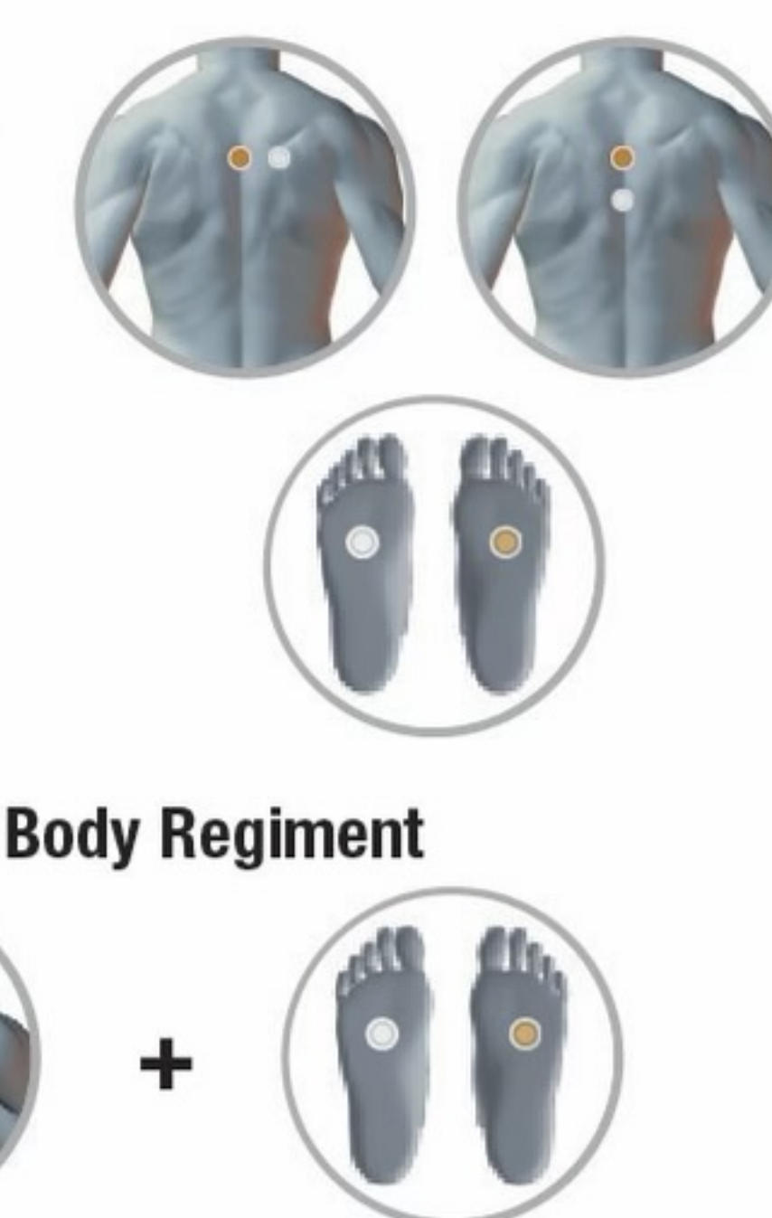
Full Body Regiment

IceWave is a safe, powerful, and effective solution for all levels of pain. Using the healing properties of light, IceWave is designed to provide fast relief at the source of discomfort. IceWave is non-drug, non-addictive and has no harmful side effects.